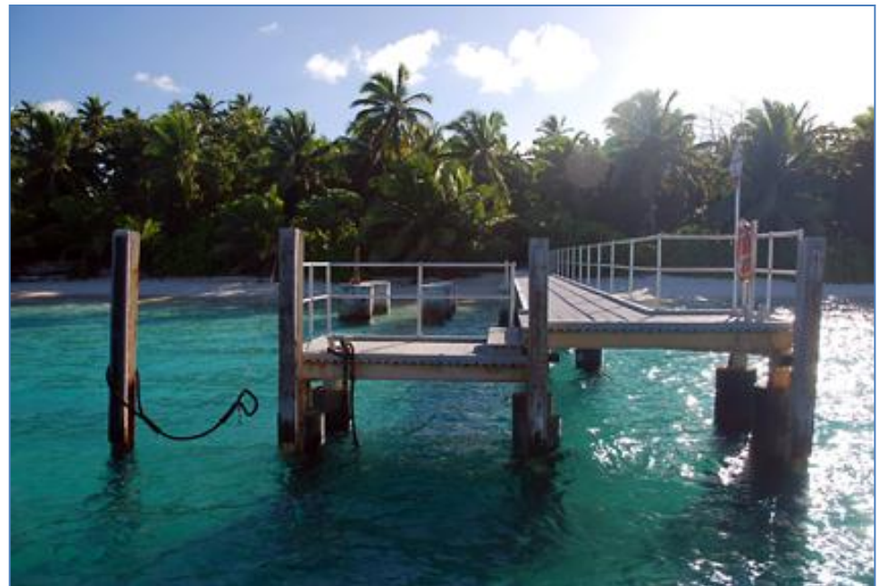
Direction Island Jetty