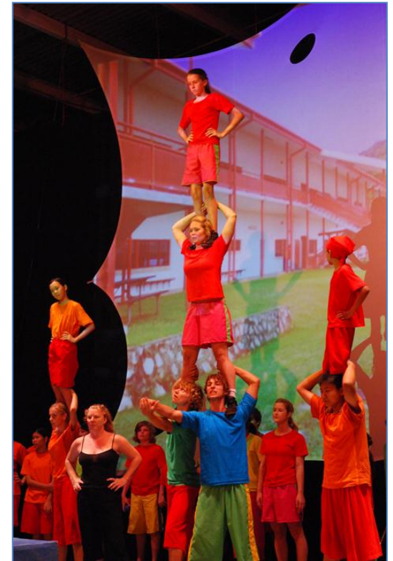
High School Circus Performance