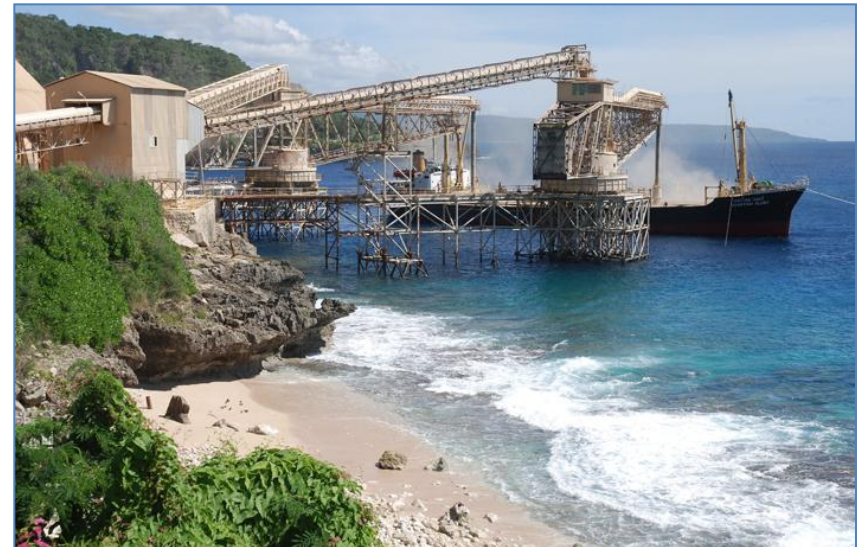
Christmas Island Phosphates