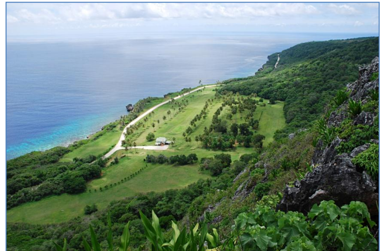
Golf Course Lookout