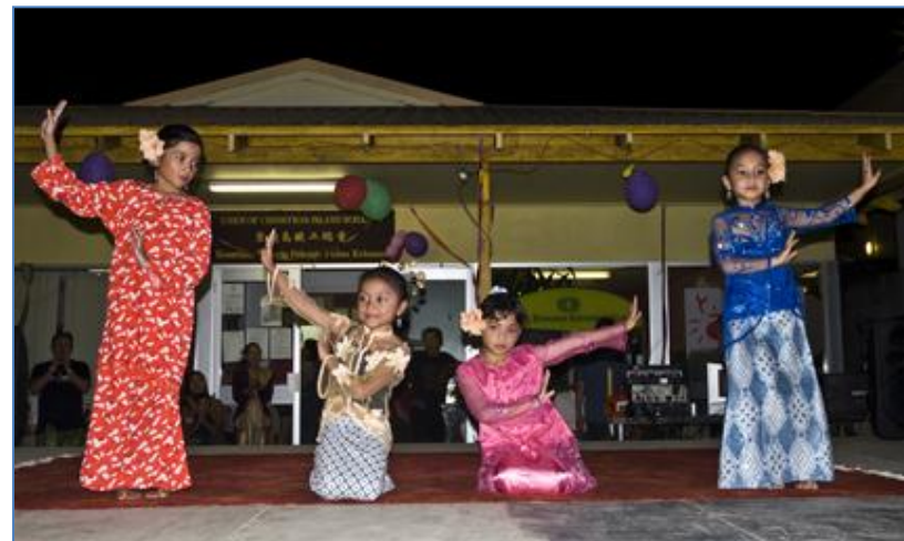
Malay Cultural Performance