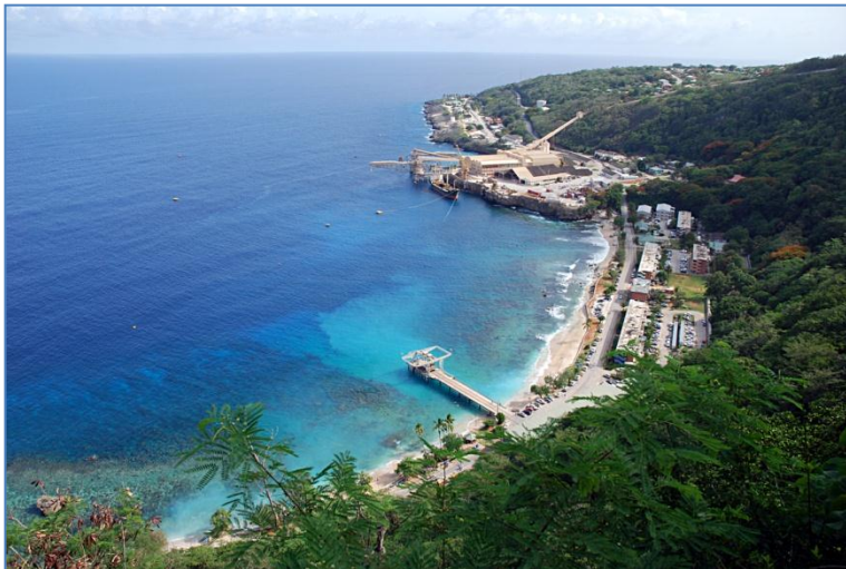
Flying Fish Cove