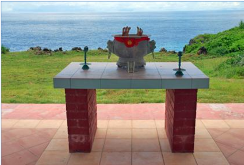
Mar Chor Nui Nui Temple