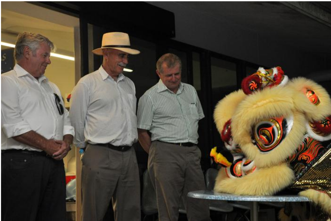
Ministers Warren Snowden & Simon Crean